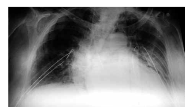
Fig. 1. Bilateral drainage of pleural cavity

The incidence of a colonic perforation can range between 0.2% and 2%. The reported morbidity following