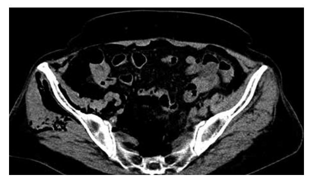
Fig. 2. Retroperitoneum